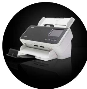
Alaris S2060w/S2080w Scanners