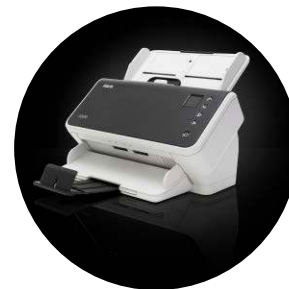
Alaris S2040/S2070 Scanners