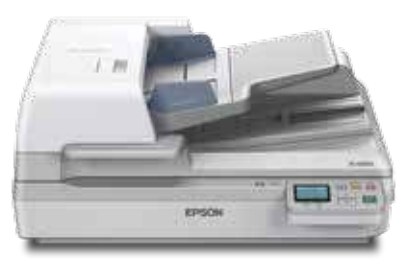
Shown with Network Scan Module; sold separately