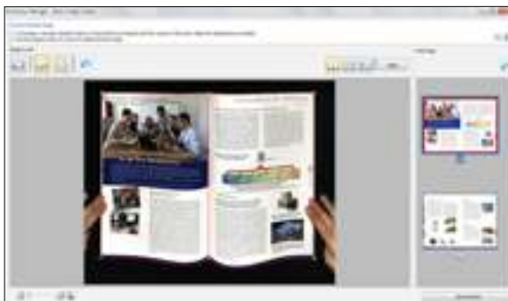
Book image correction Flattens and corrects curve distortion.