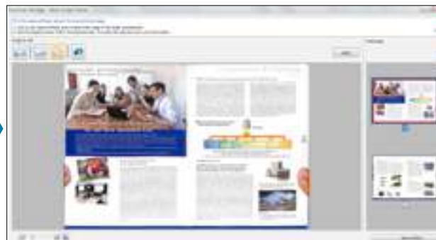
Point retouch function Fingers captured during scanning can be removed.